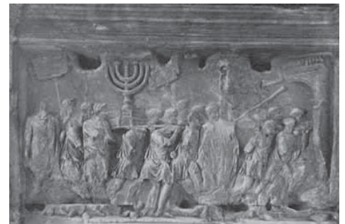
Arch of Titus Detail: Spoils of Jerusalem