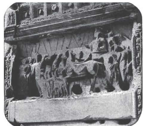
Arch of Titus Detail: Triumph of Titus